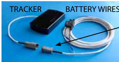
TRACKER BATTERY WIRES