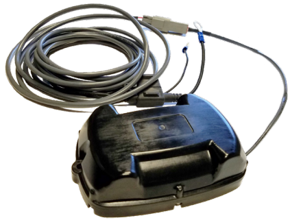
ST-5000 Tracker and Battery Wires